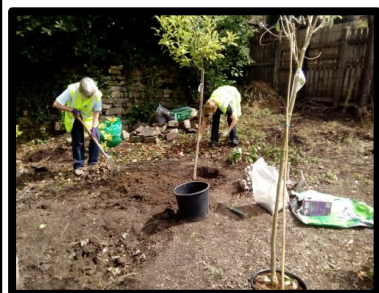
Recent work at Regent St

Got a new class or group starting? Want to recruit volunteers?