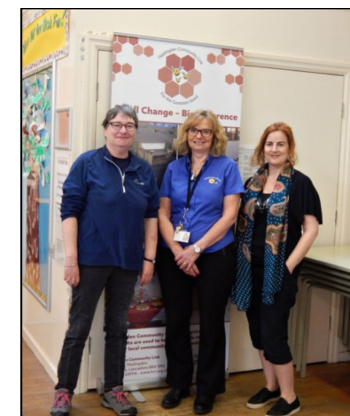
Some of the team

https://issuu.com/lengrant/docs/haslingden_issuu