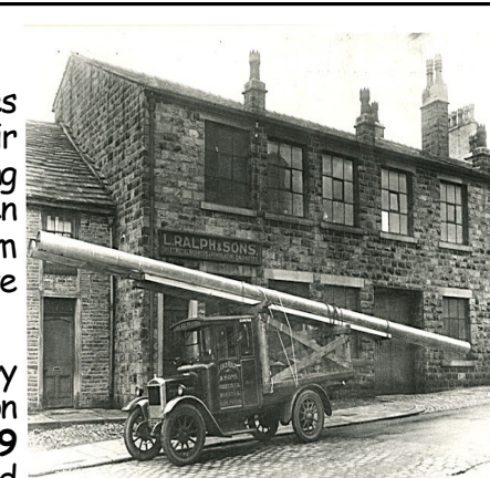
Taken from Haslingden's blogspot.com with thanks.

Haslingden Roots, Haslingden Old and New and Helmshore Local History Society are holding Haslingden and Helmshore Memories Exhibition on Saturday 1st June 2019 12 noon to 5pm and Sunday 2nd June 2019 10am to 4pm at St Veronica's Church Hall, Helmshore. There will be old newspapers to read, War Heroes display, old photographs and also photographs from the Garth Dawson Collection. There is no admission charge but donations will be accepted to cover the costs of holding the exhibition.